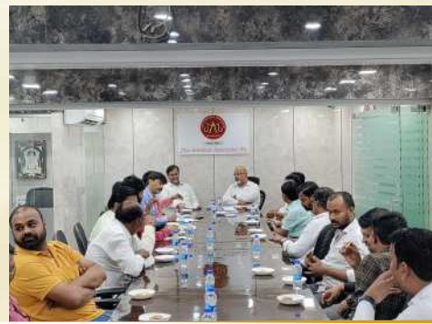
Bullion Sub Committee Meeting