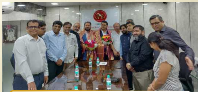
Team JAB felicitated JOS ALUKKAS Group of Directors