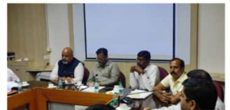
Team JAB, KJF and Vishwakarma Samithi dignitaries met Dr. G. Parameshwar , Home Minister of GoK & presentation given regarding fraternity related issues.