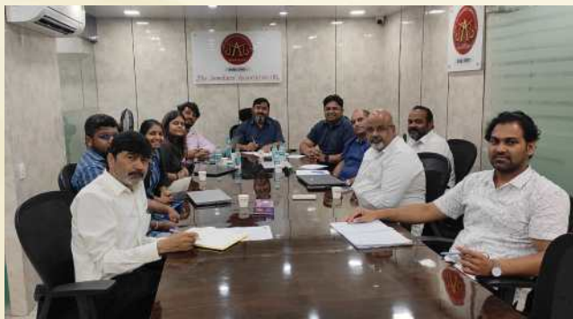
IT Sub Committee Meeting