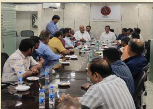
Silver Sub Committee Meeting