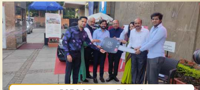
BGF 2.0 Bumper Prize of Maruthi i10 Car Distribution