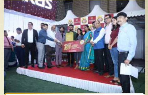
BGF 2.0 Bumper Prize 1kg Gold Distribution